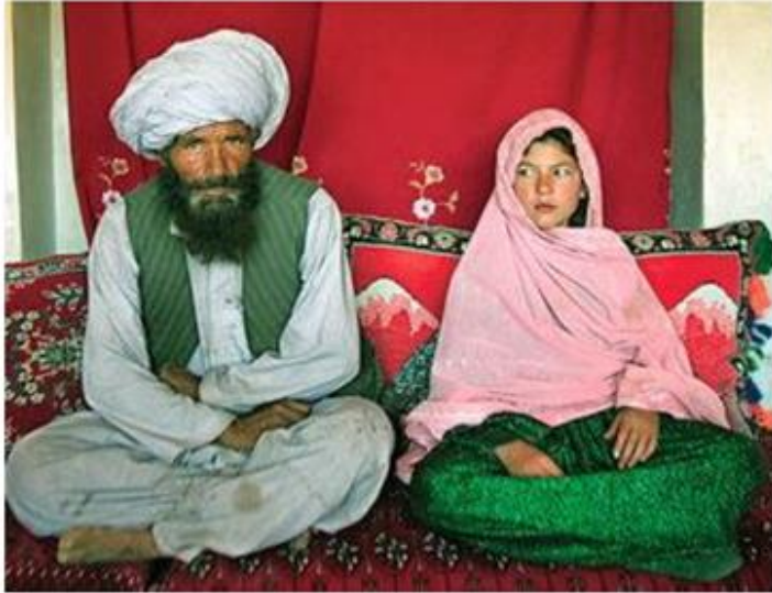
Holy Islamic Council approves child marriage.

The Council of Islamic Ideology (CII) in Pakistan declared girls as young as nine year old are eligible for marriage.