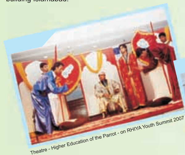
Theatre - Higher Education of the Parrot - on RHIYA Youth Summit 2007