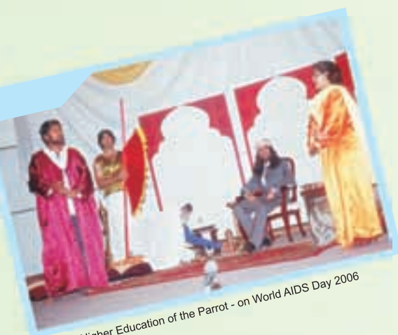
Theatre - Higher Education of the Parrot - on World AIDS Day 2006