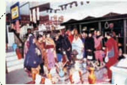
Skilled Men & Women